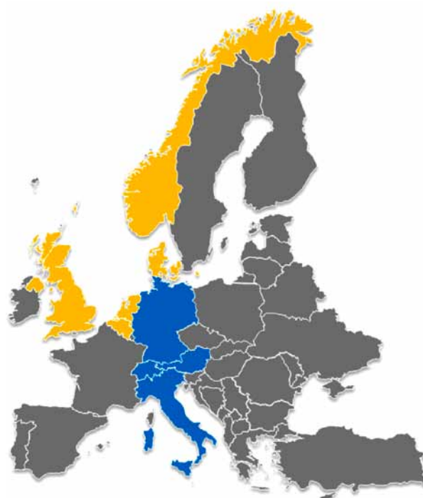
Fig. 2. Review of national biochar legislation in Schmidt and Shackley (2016) (analyzed countries are depicted in yellow color) and in this article (analyzed countries are depicted in blue color)

The German Fertilizer Ordinance regulates thresholds for certain mineral and organic pollutants for all