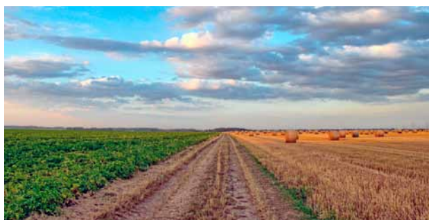
Fig. 1. The bumpy path towards biochar standardization and legalization harmonization in the European Union

The development of the sustainability policy around biofuels in the European Union in the last decade has however shown that voluntary product standards can be integrated into upcoming legislation with the aim to guarantee the sustainability of e.g. biofuel production (Dehne et al. 2007). In this case, the voluntary standards are benchmarked against an overarching meta-standard written down in the respective legislation (e.g. the Renewable Energy Directive (2009/28/EC) (Official Journal of the